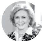
by Gloria Copeland