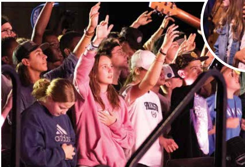
14forty youth services at Southwest Believers' Convention and Superkid Academy (inset)

God moved once again during EMIC's annual Miracles on the Mountain meeting. This popular event welcomed more than 750